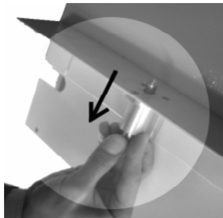
EXCUSIVE ONE-STEP HOLD SYSTEM.