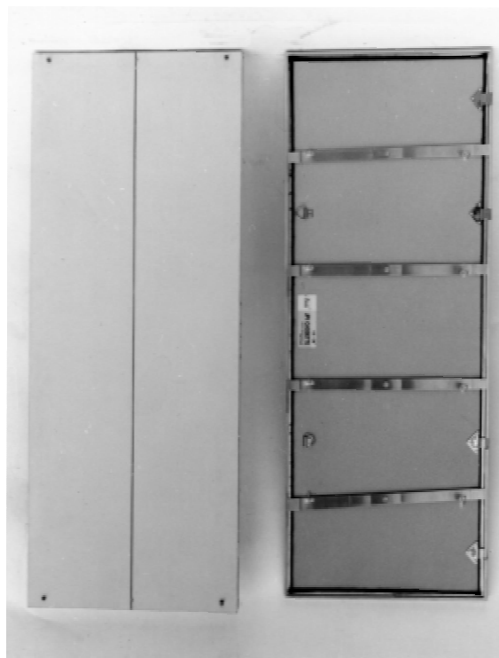
CHASSIS DETAIL RELATIVE TO THE RSD